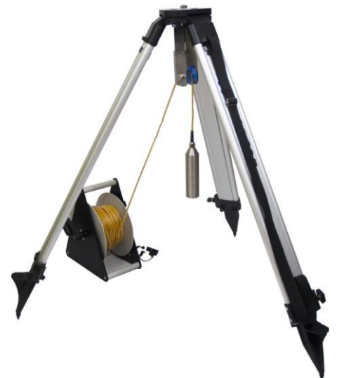
TEL-903-000: suspending tripod →