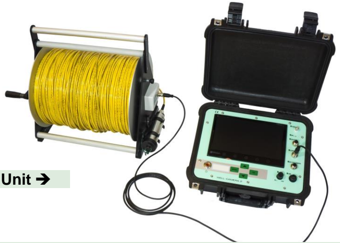
← ASPO 50: with 50m of fiberglass cable & Teflon adapter for Well-Camera Head

Aspo dim: 51cm x 62cm x 22 cm - Weight: 5,55 kg Teflon adapter: Ø 4,2 cm x 12 cm