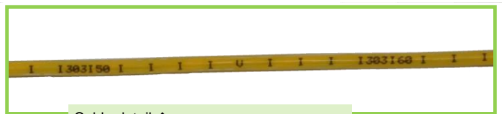
Cable detail ↑