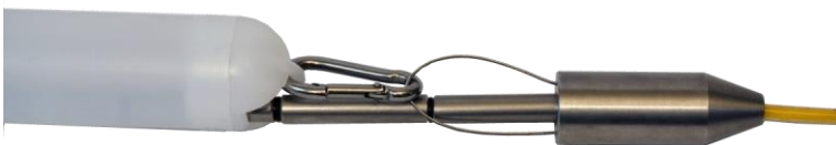
Removable hook for bailer (the probe can be inserted in the sampler)